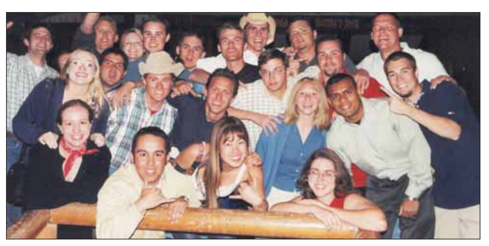
Members of the UA Student Chapter of SCE at the Pacific Southwest Regional Conference

"Last year, we had high point values in the big events, such as the seismic design, concrete canoe and steel bridge. However, this year, the bridge failed and our canoe broke.